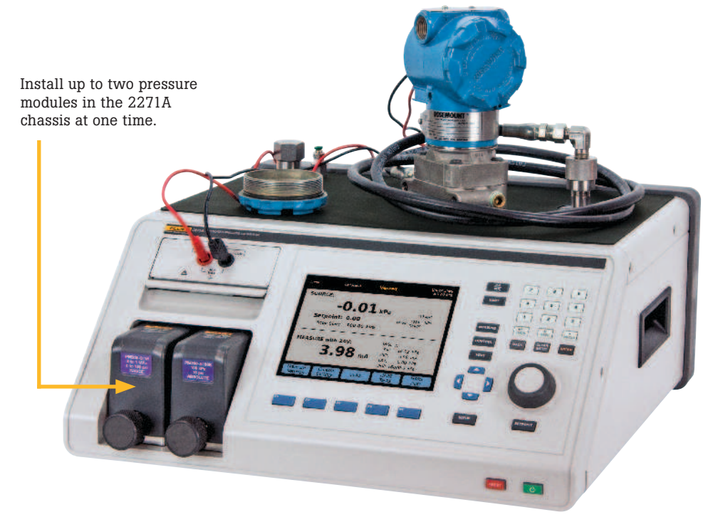
Use the 2271A to perform closed loop, fully automated calibration on 4-20 mA devices like this transmitter.

The 2271A accuracy specifications are provided in full and supported by a technical note that details its measurement uncertainty so you know exactly what you are getting. This technical note is available for download on the flukecal.com website. As with all Fluke Calibration instruments, these specifications are conservative, complete and dependable.